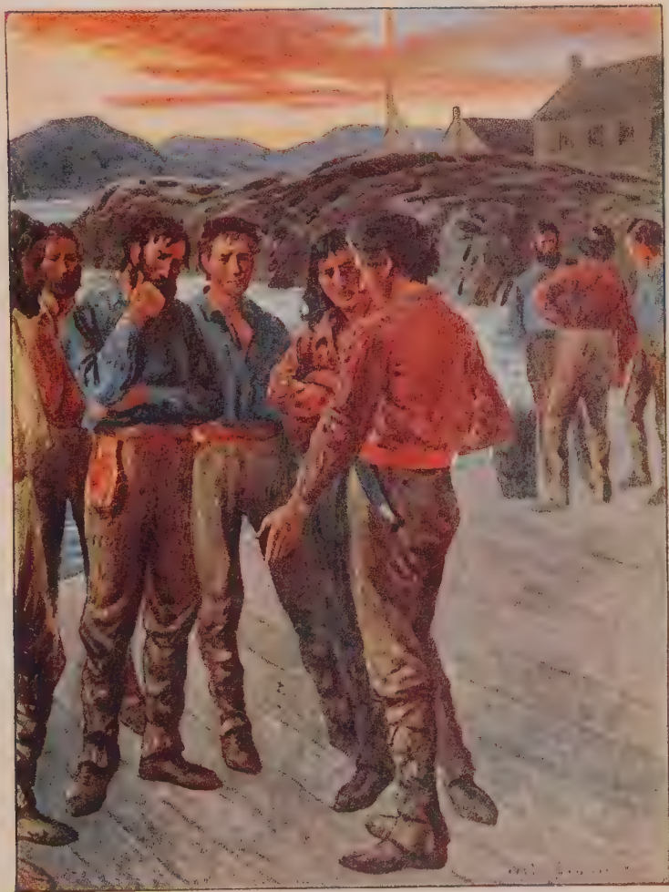
“On the end of the wharf that jutted out into the stream was assembled a picturesque group of men.”